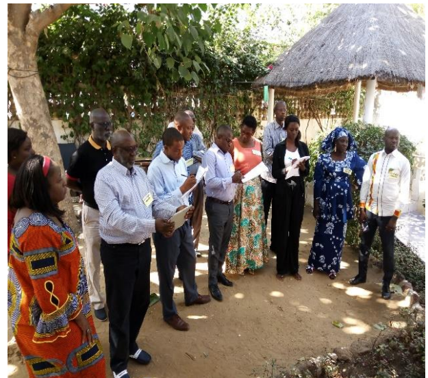
Feedback of group work